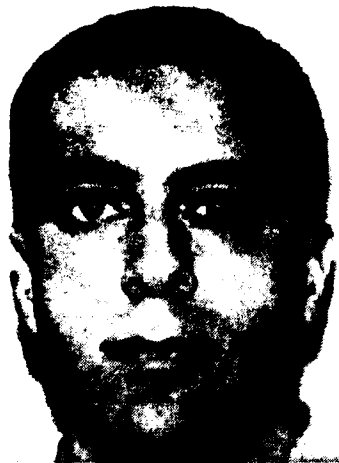
Ziad Samir JARRAH

United Airlines #93 Newark to San Francisco Stony Creek Township