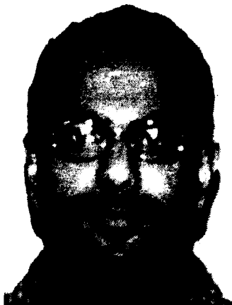
Marwan Yousef Muhammad Rashid Lakrab ALSEHHI

United Airlines #175 Boston to Los Angeles South Tower World Trade Center