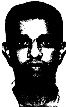
Satam M.A. AL SUQAMI

American Airlines #11 Boston to Los Angeles North Tower of World Trade Center